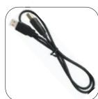
USB data cable