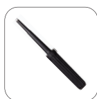
Probe adjust pen