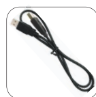
USB data cable